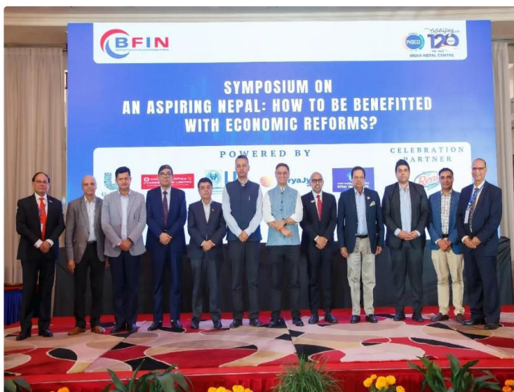
Participants of the symposium.

KATHMANDU: The Banking, Finance and Insurance Institute of Nepal (BFIN), in collaboration with the India-Nepal Centre of the PHD Chamber of Commerce and Industry (PHDCCI), organized a high-level symposium titled "An Aspiring Nepal: How to Benefit from Economic